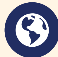
PEOPLE FROM DIVERSE CULTURAL GROUPS