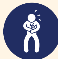
PEOPLE WITH CHRONIC & COMPLEX CONDITIONS