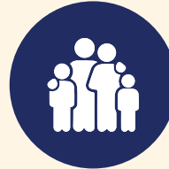
CHILDREN, YOUNG PEOPLE & FAMILIES

Western Sydney is a diverse community with a complex range of health needs, but we've prioritised some groups due to their significant health needs.